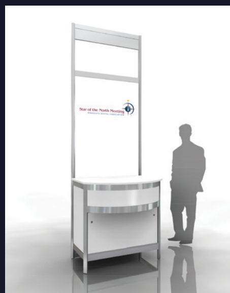
Preliminary rendering subject to change.