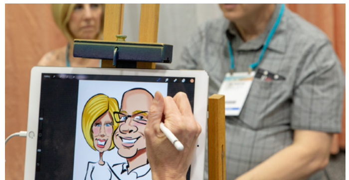
EXHIBIT HALL SCHEDULE