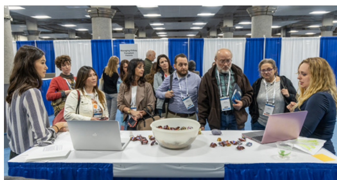
EXHIBIT HALL SCHEDULE